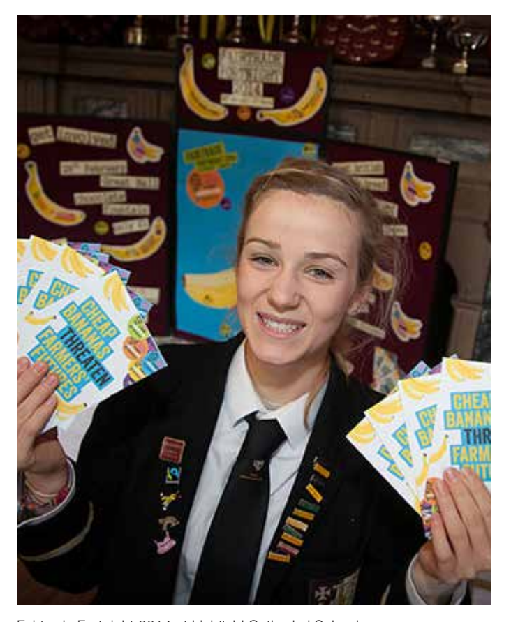
Fairtrade Fortnight 2014 at Lichfield Cathedral School

Fair Trade or fair trade products do not carry the FAIRTRADE Mark. They relate to the wider movement of organisations working to promote fairer trade policy and practice and include fairly traded products like handicrafts, some jewellery and toys.